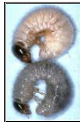
Adult and larvae of Aphodius tasmaniae

This is a pest species (native) that has been found in a number of traps. The cockchafer grubs feed on humus in the soil until the autumn rains soften the ground and promote pasture growth. Grubs then tunnel to the surface, and come out at night, often in response to heavy dew or rain. They collect fresh pasture leaves which they drag into their tunnels for consumption during the day.