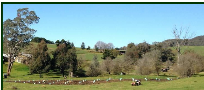
Above: Planting near Cherry Tree Ck - Kergunyah