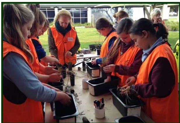
Above: Potting up natives at Student Environment Day