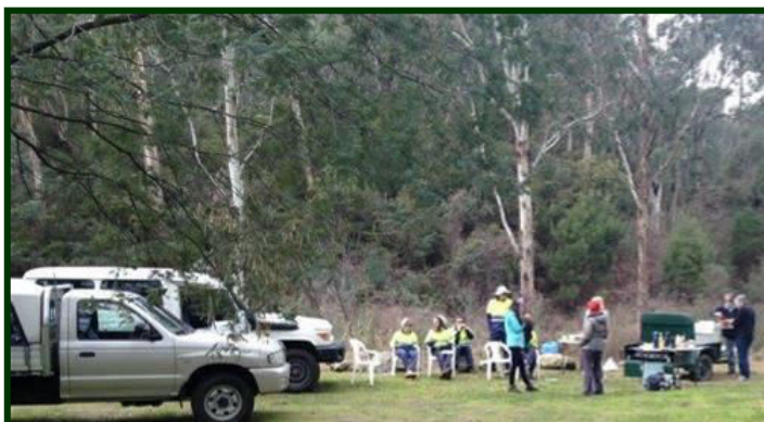
Above: Green Army Landcare Thank-you BBQ lunch at Rockpool Rd